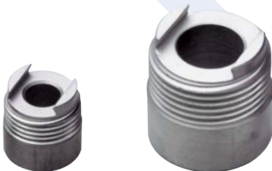
ZAC 1738 xx