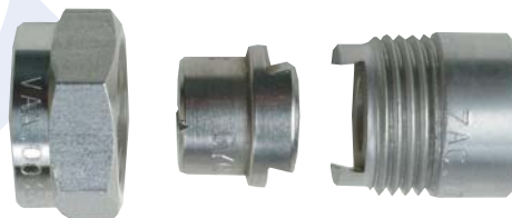
Typical assembly with dovetail nipple and nut.